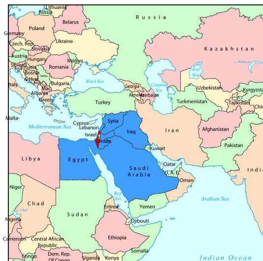
Israel's neighbors not named in Alliance = blue

Look Who Got Left Out of Gog’ Alliance. Did you notice the nations of the Middle East the text fails to mention as joining Gog’s Alliance? Nations one might assume to be a part of the Alliance if for no other reason than their geographical proximity to Israel (they are Israel’s closest neighbors)? Here is a map showing the nations that neighbor Israel but which are not named by the text as a part of Gog’s Alliance: