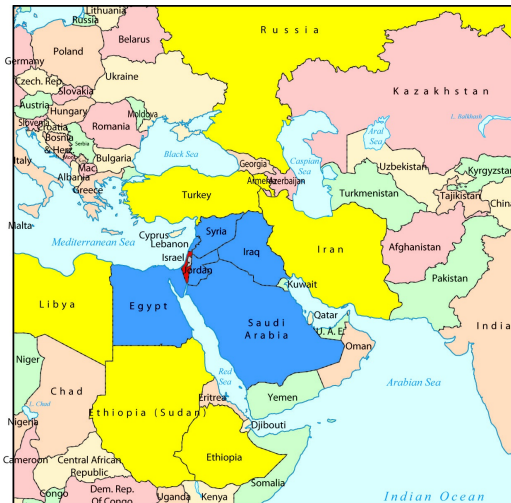
Israel's neighbors not named in Alliance = blue Nations named in Ezek 38/39 to be in Gog's Alliance = yellow